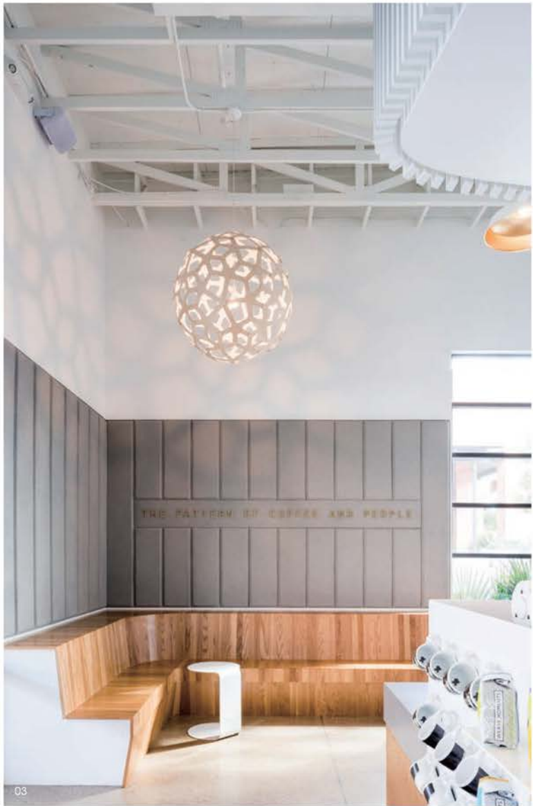
02 / Sylvan Avenue patio 03 / Bench seating in Houndstooth Coffee 04 / Cedar screen with Houndstooth supergraphic 05 / Interior of Houndstooth Coffee