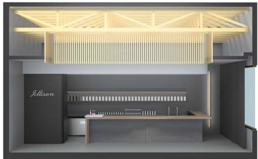
Section perspective of Jettison Cocktail Bar