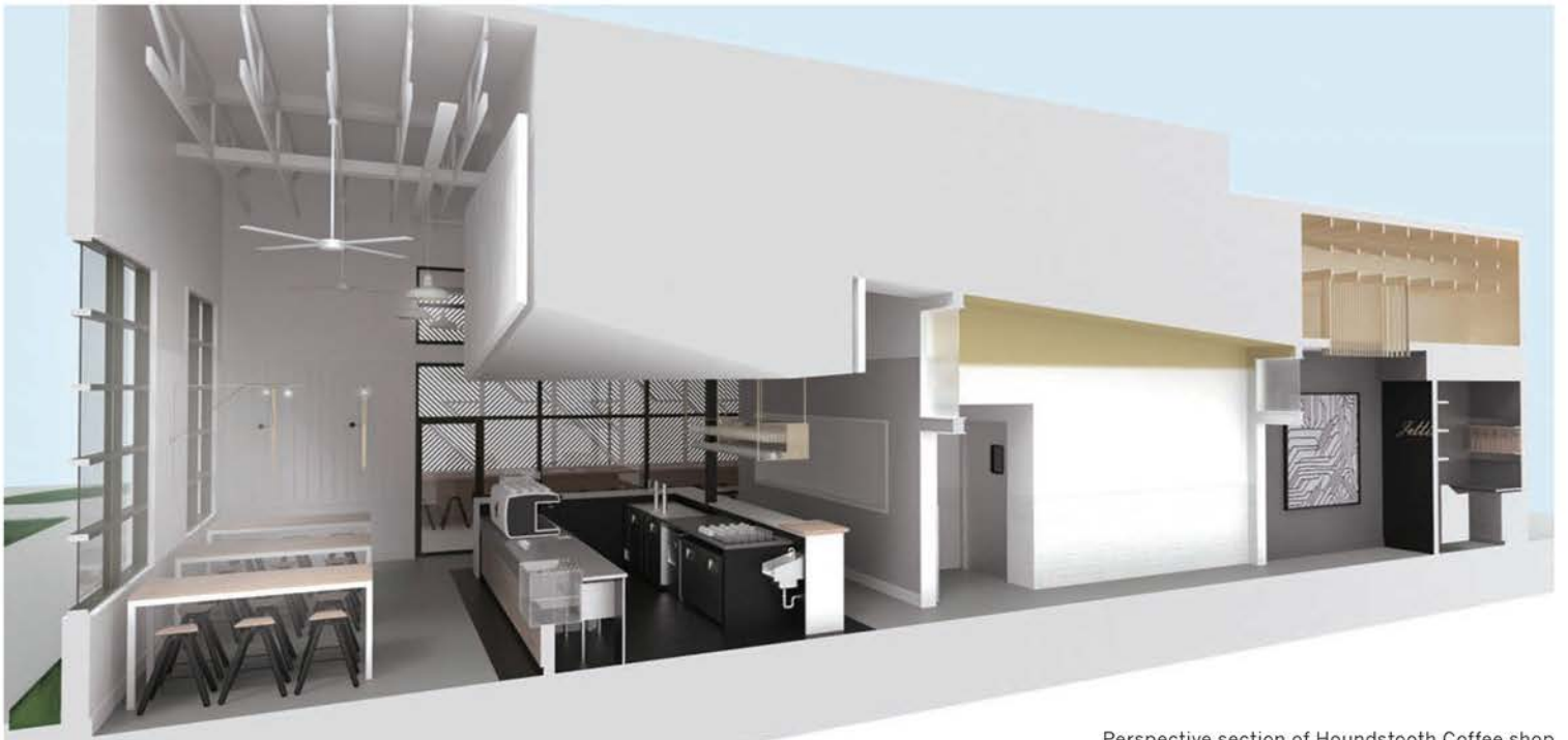
Perspective section of Houndstooth Coffee shop